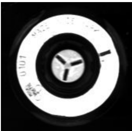
Fitting: Part OK

Vision systems are used for the automatic inspection of beer kegs