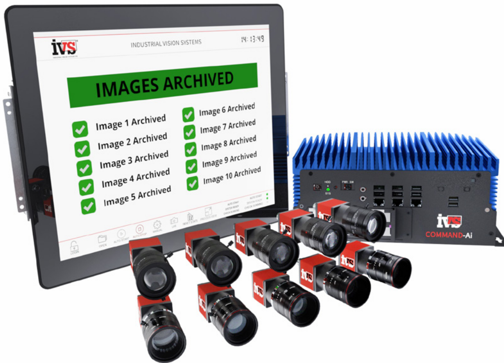
Photo capture, save and recall

Protect your brand and provide warranty protection against claims by automatically saving Ultra HD photos of all your products before they leave your factory. Automated traceability through image capture, save and recall.